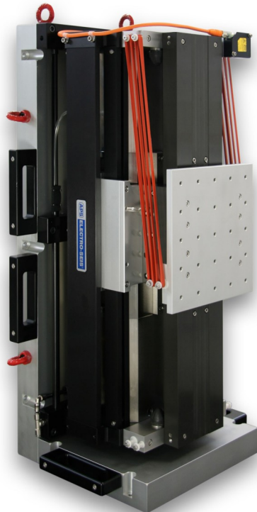
APS 600 - Vertical Operation with APS 0109 - Zero Position Controller

The driver unit employs permanent magnets and is configured such that the armature coil remains in a uniform magnetic field over the entire stroke range ensuring a high degree of linearity. The self-cooled armature coil requires power from a matching electronic power amplifier.