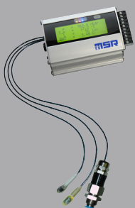
MSR255 with ext. sensors