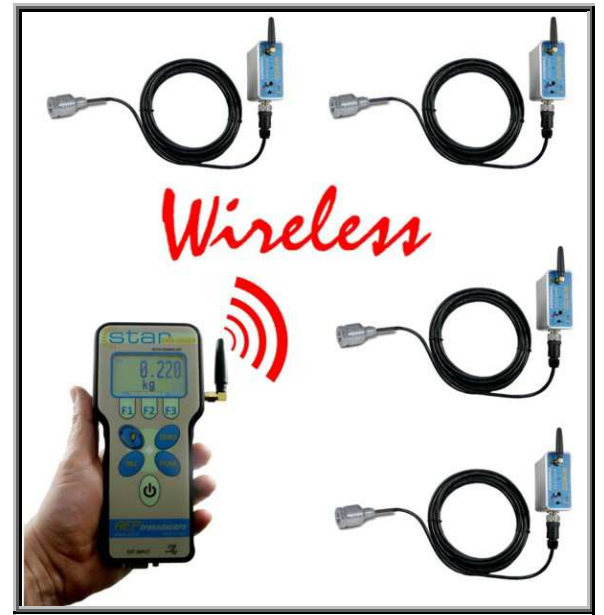
Monitoring of pressures by using con TP1 and TP16 pressure transducers.