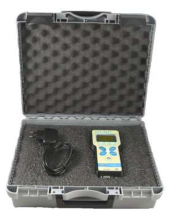
Travelling case made of ABS