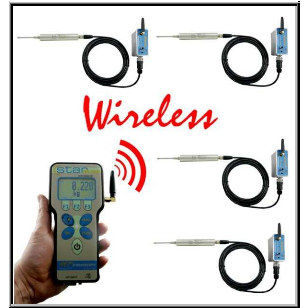
Displacements Monitoring by using LDT transducers.