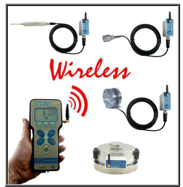
Monitoring of different sensors for example: LDT for displacement measurements TP1 for pressure measurements TRX for torque measurements. C2S for force or weight measurements.