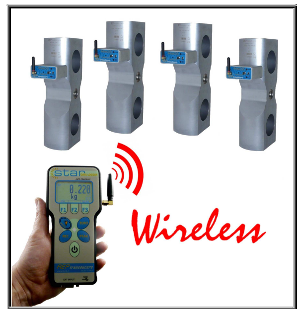
Overhung loads monitoring by using T20, D200 etc. .. dynamometers or load cells

It is possible to simultaneously connect to the WiSTAR (through a Wireless connection) n° 1, 2, 3 or 4 WIMOD modules directly connected to the load cells or in the stand alone mode.