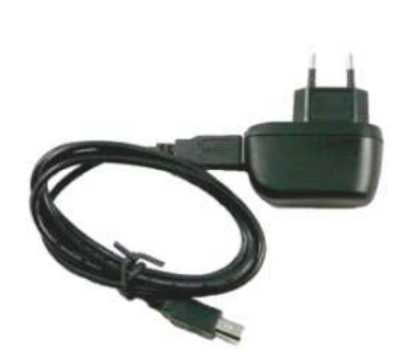
Feeder with USB cable